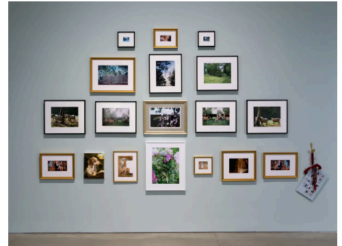
Installation view: Karen Kilimnik, 303 Gallery, New York, 2019.

In the gallery’s darkened rear viewing room, a gunmetal gray pirate ship (2019), constructed from a readymade model kit (as are several sculptures of historic tourist sites—the Eiffel Tower, Leaning Tower of Pisa, Louvre—on pedestals in the main room), is silhouetted against a spotlighted unstretched canvas (2019) depicting a painted map of the British Empire, post-American Revolution, with its remaining territories painted pink. Sea monsters swim in three corners, common motifs in period maps representing unknown or “barbaric” regions, contrasting with the stately allegorical figure of Britannia in the upper